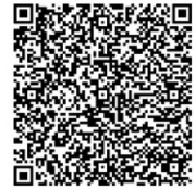
'73 CLASS REUNION PATCH